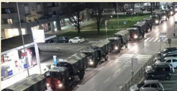
Army trucks carrying coffins out of the city of Bergamo in Italy, March 2020

One of the cruelest aspects of our current predicament with the Covid-19 pandemic is that family members cannot accompany their loved ones during their dying days in hospital and are denied even the capacity to mourn together or to bury their dead. This image from March of this year of army trucks hauling bodies out of Bergamo in Italy because the cemeteries and crematoria are overwhelmed beyond capacity is a haunting one.