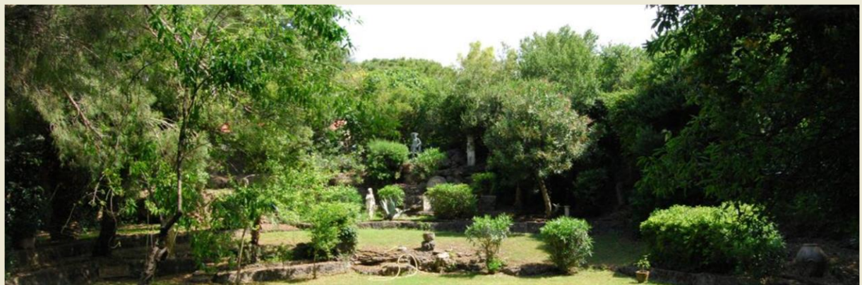
Park of the convention centre in Paestum, South Italy