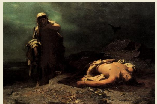
Antigone with the body of her brother Polynices - Nikofores Lytras, 1865